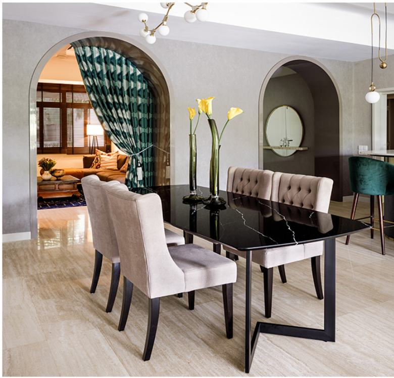
The dining area is illuminated by a branch-inspired luminaire, while the black marble table is paired with beige tufted chairs

The living room is furnished with a bespoke curved sofa and an 8 ft artwork, which was especially commissioned to a European artist, framed in a glossy white and gold frame. Two off-white sofas sit on the two abstract carpets. A white glass coffee table with curated artefacts act as a bridge between the two sofas. "One of our favourite elements is the yellow, blown glass side tables that filter the light and create drama in the living room, while the pair of brass accent chairs are considered pieces of art themselves," says Loberg.