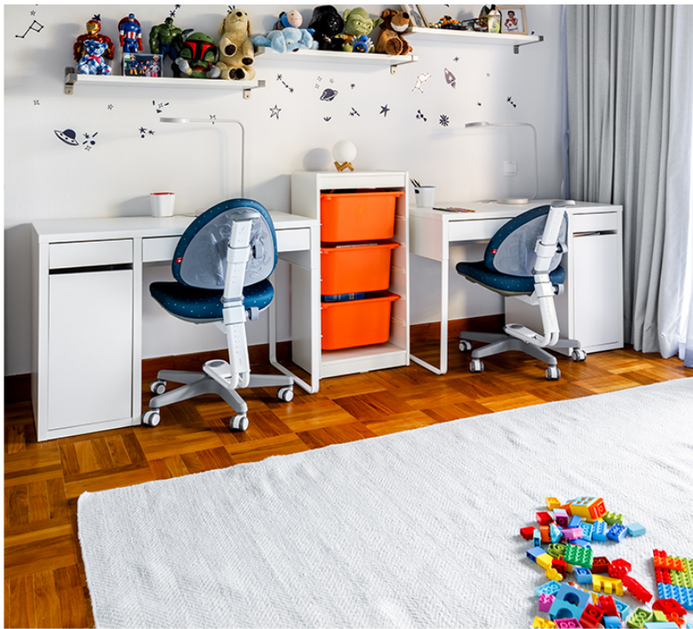
The son's room highlights a galaxy installation on the wall and lots of storage space for toys

“People have understood the value of making their homes closest to their dream hotel room. Luxury at home has become a new necessity and is no more limited to just the living and dining spaces.. It has travelled further inside to bedrooms, bathrooms and kitchens too because we have all realised the value of our homes,” says Jain. “Our ever-evolving style is underpinned by a subtly coordinated fusion of East meets West; clean lines and neutral tones, blended with charming warmth and sumptuous opulence,” she concludes.