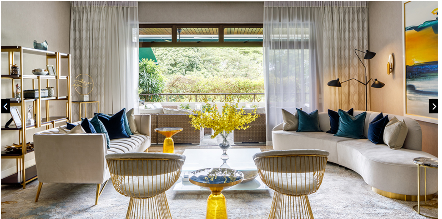
View of the living room showcases two artsy brass seaters, yellow blown glass side tables and a view of Arcadia Road's lush canopy; Photographs courtesy Nidhi Jain

Every time we check into a holiday home or hotel, we're overwhelmed by the sheer comfort and luxury that the space offers. In light of recent events, we've only been dreaming of hotel rooms, captivating design and cosy bedding. Singapore based architect Nidhi Jain of Nidhi Jain Architecture & Interiors and her interior design partner Emily Loberg, fashioned an opulent home for their clients right before the Lion City announced its lockdown, and they couldn't be happier.