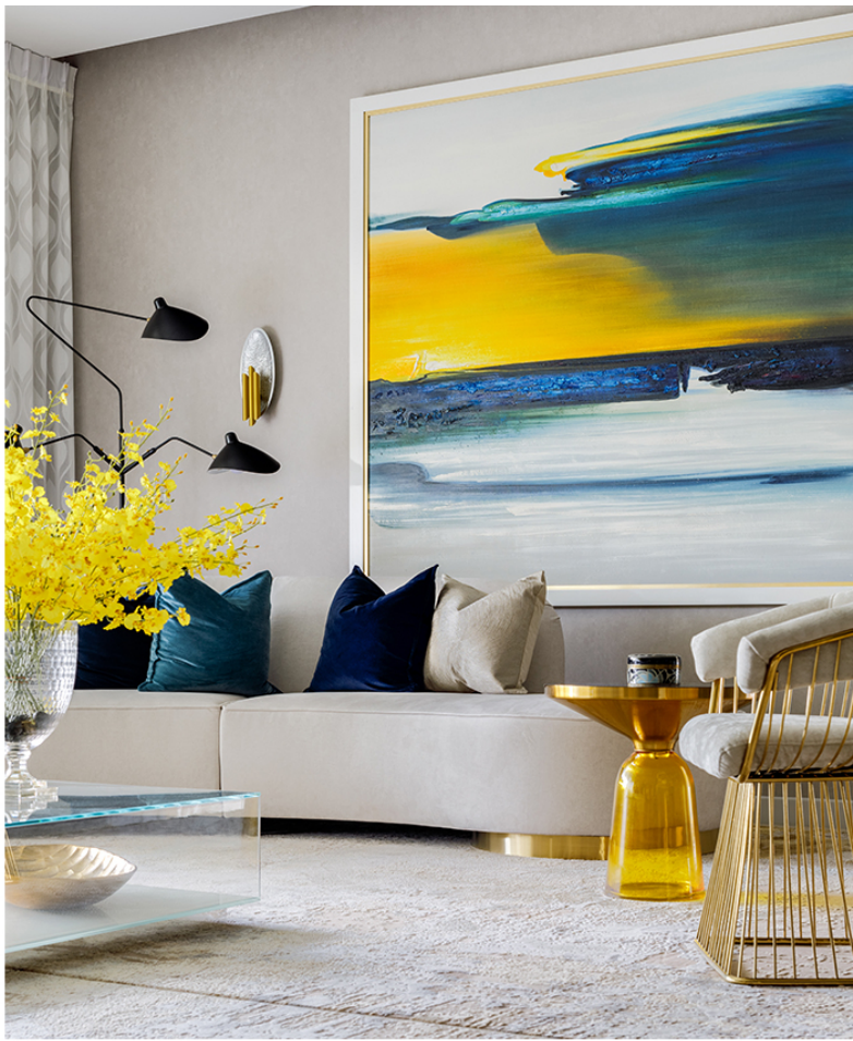
An 8ft-tall artwork, framed in glossy white and gold, especially commissioned to a European artist, is paired with the off-white sofa and vibrant, velvet cushions