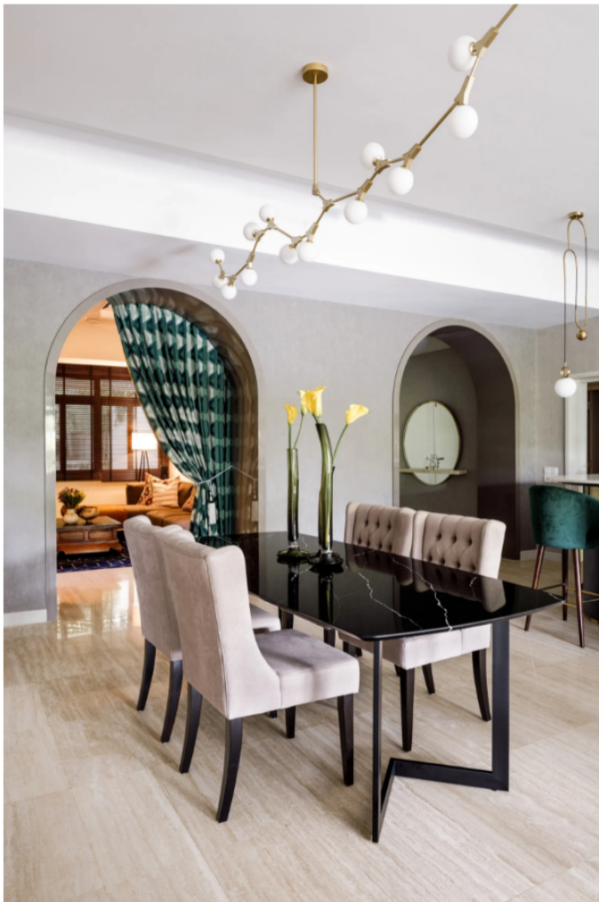
The organic-style lighting piece adds character to the dining

Again, an arch forms the backdrop for the dining table. An ornate green silk curtain lends the space an almost theatrical feel and also gives a peek into the TV room beyond. Situated opposite the dining table is a buffet table accentuated by two faux ivory mirrors with brass detailing.