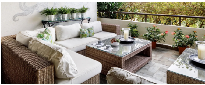
The balcony oozes laid-back luxury