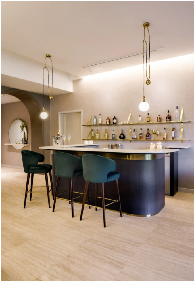
The glittering material finishes up the ante of this space